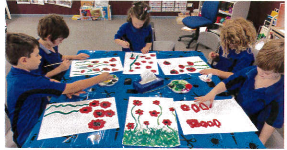
Junior students painting Poppies in Art.