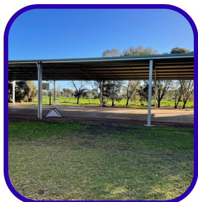
Undercover Playing Area