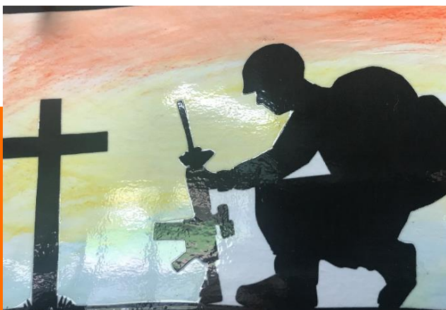
Junior Room Anzac Day Art Work

NAPLAN testing for students in Grade 3 and 5 will be conducted in Week 4 on Tuesday May 14, Wednesday May 15 and Thursday May 16. Students will undertake a Reading, Language Conventions, Writing and Numeracy test over the three days. Students will undertake some practice tests over the next few weeks to best prepare them for the tests. More information will go home to the Grade 3/5 students next week. We will be taking a relaxed approach to the tests to ensure students are keen to do their best without any unnecessary pressure or anxiety.