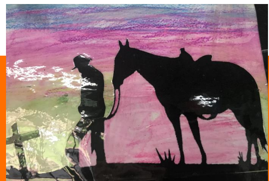
Junior Room Anzac Day Art Work