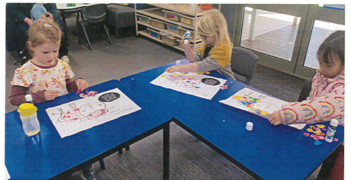
Prep Come & Try Day Session 1