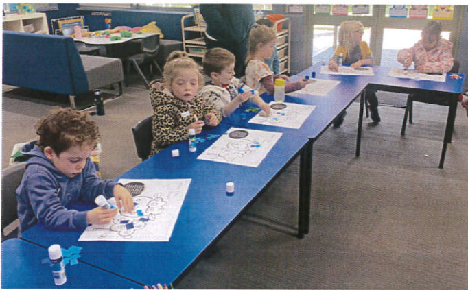
Prep Come & Try Day Session 1