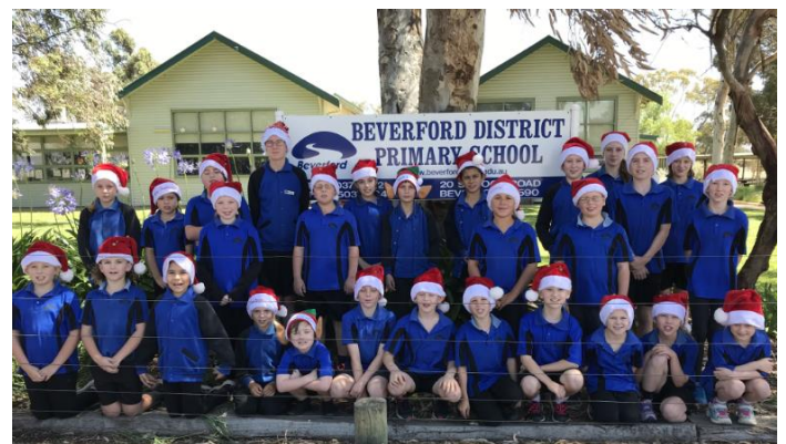
We wish everyone a very Merry Christmas!