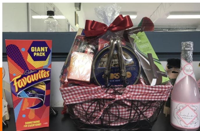
Raffle Prizes for the Christmas Raffle

If your child has been officially diagnosed with Asthma, it is mandated that an up to date Asthma Plan is filled out and signed by a doctor and handed into the school. These Asthma plans are vital to ensure staff at the school follow the necessary procedures. If you have any questions about this, please contact me at school.