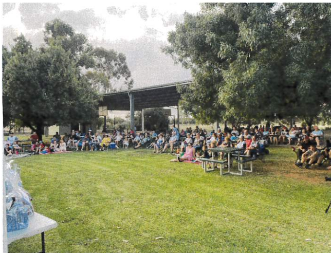
Thanks to everyone who attended the concert