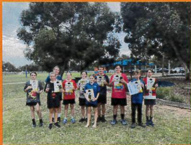
Congratulations to our graduating Grade 6's

Thanks to everyone who attended and to families who contributed to the raffle with donations and ticket sales.