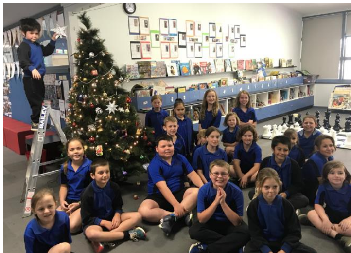
Forest of Xmas Trees raised $2925 for the school

It was decided at School Council to purchase a TV for the Hall, headphones for the students and put the remaining funds towards the school camp.