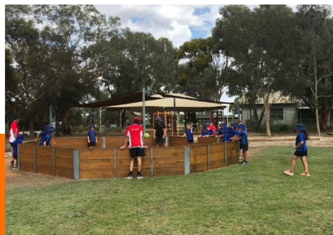
Students from BDPS and SHSS playing GaGa Ball together at recess.