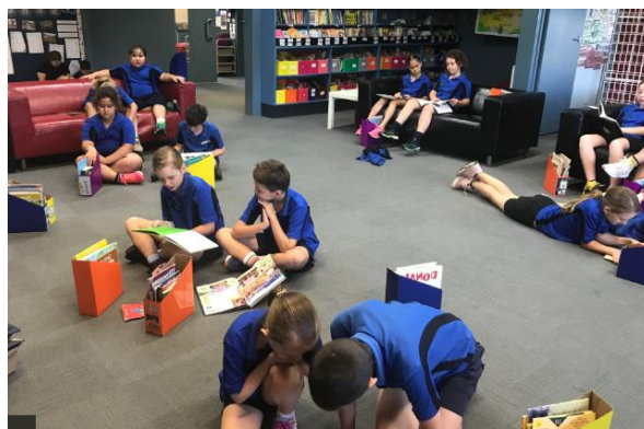
Group Reading is from 9 – 9.30am every Wednesday, parents are welcome to attend and listen to reading.