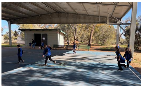
Line-Tiggy in Junior Sport today