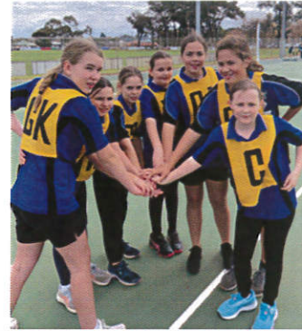
Runners Up - BDPS netball team