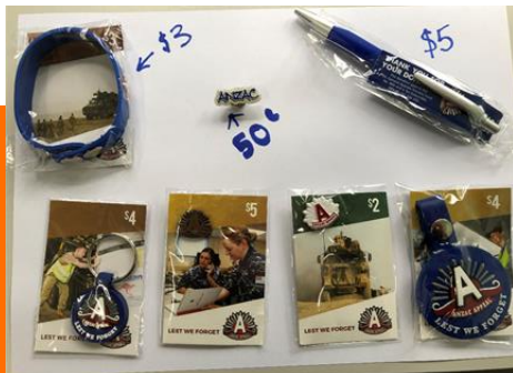
ANZAC Day Appeal

The school is involved in the ANZAC Day Appeal with items for sale at the office. Prices are pictured below. Please send cash only to school with your child.