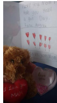
Happy Mother's Day for last weekend.

We hope that all of our wonderful Beverford Mums had a great Mother's Day last weekend and were spoilt rotten. In this time of remote learning, we have added another huge responsibility to Mums with an already massive workload. Please know that we value what you are doing.