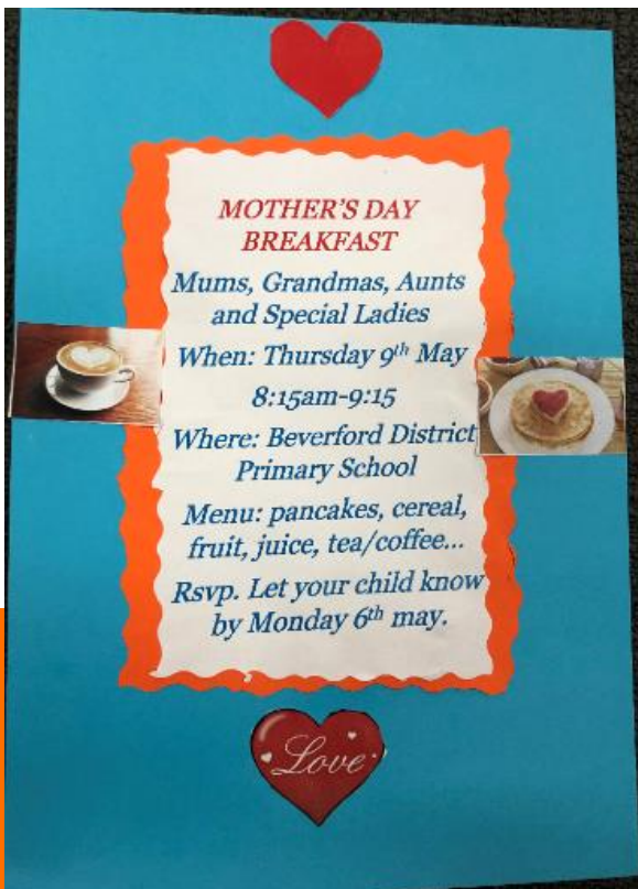
Mother's Day Breakfast Invite example.

Seven students were awarded home reading awards at Monday's assembly. Congratulations Kiara, Darcy, Tillie, Aidan, Liam, Phoenix and Jackson. If you would like suggestions around developing home reading routines and strategies for helping your child, please contact your classroom teacher.