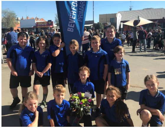
School students preparing for march.