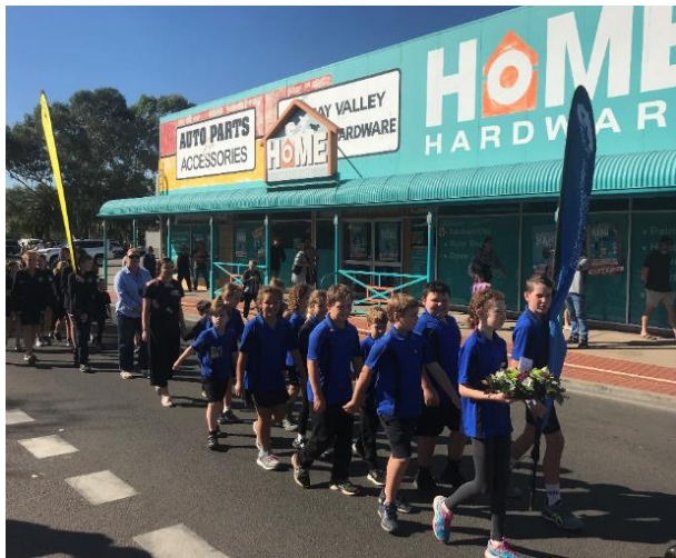
Students at the beginning of the march.