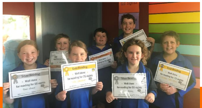
Home Reading Award Winners.