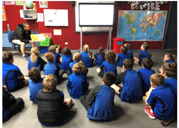
National Simultaneous Story time