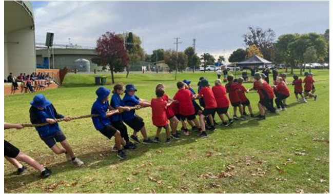
Beverford and Lake Boga students winning the Tug 'O War

A reminder that Book Club Orders are due by Monday May 10. The preferred method of payment is online and is explained in the catalogue. It is up to families whether they choose to purchase from Book Club, there is no pressure or expectation from school.