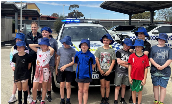
Senior students after the Police Station tour