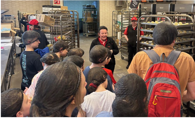
Students visiting the Coles Supermarket during the Sleep Over