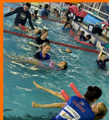
Students pictured during the Swimming Program.

A big thank you to our staff for assisting with the program. We are very fortunate to have multiple trained Auswim teachers on staff.