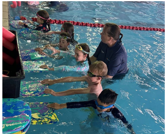
Week 2 of Swimming Program