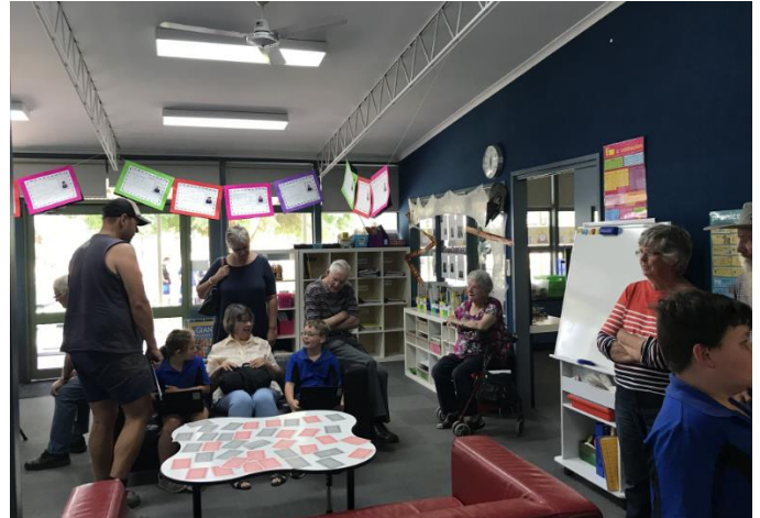
Visitors to the school on Open Day