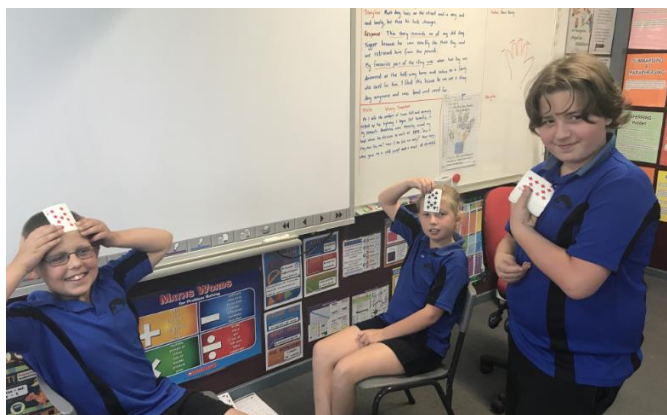
Gr. 4-6 have learnt new card Maths games.