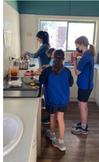
Breakfast Club is back running every Wednesday morning

The Swimming Program begins on November 8 and will run for six sessions on Mondays and Thursdays. We will travel in by bus to the Swan Hill Leisure Centre to undertake the lessons. A permission note with more information will be sent home closer to the date.