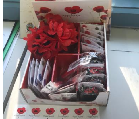
Poppy Appeal – on sale at school