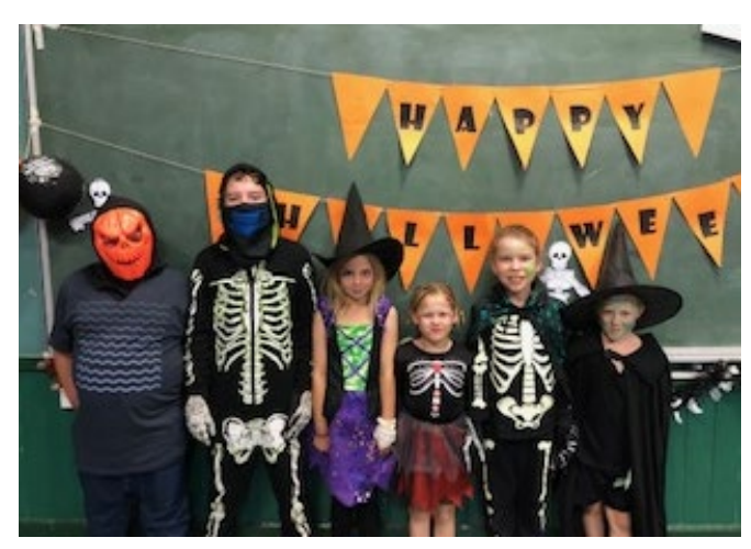
Halloween Disco Wednesday October 17, 2018