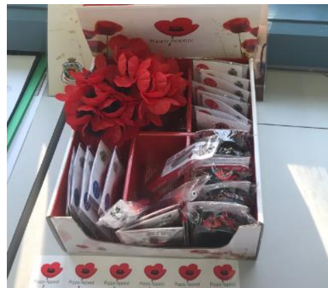
Poppy Appeal – on sale at school

Tickets at the door Adults $22 Concessions $18 Children $15 Refreshments for sale natasha@strikeaposedancestudio.com