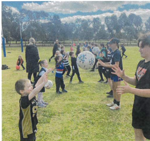
Students participating in the Footy Colours Day clinic.