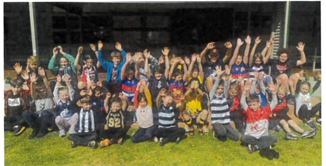
Our School Photo on Footy Colours Day.